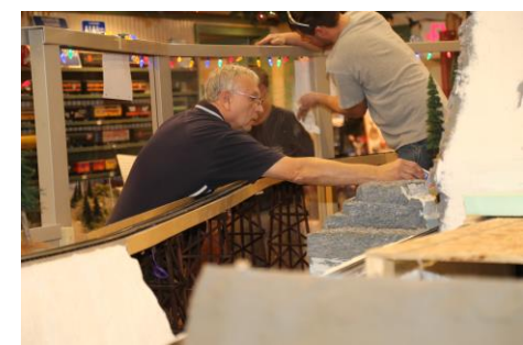
The Big Mountain continues to look better under Steve's direction