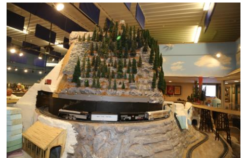
UP 10000, SF FT's and NYC Hudson wrap around the Big Mountain