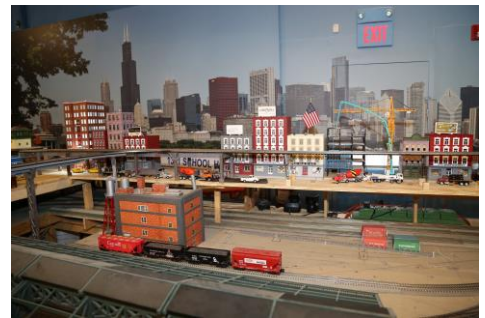
Following the Belt Line panorama picture to Chicago and viewing the "EL"