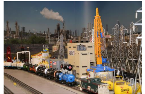
Scenes from the Belt-Line with the panoramic picture in the background. Power plant and Refinery