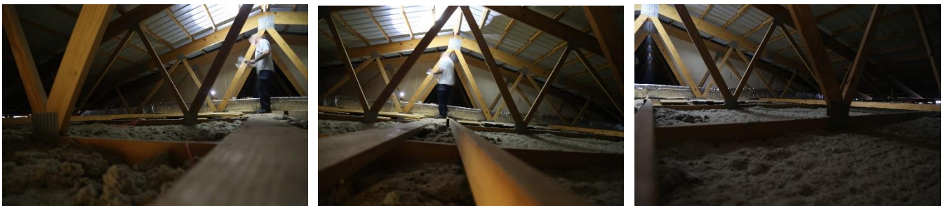
Trunk line installed in our attic