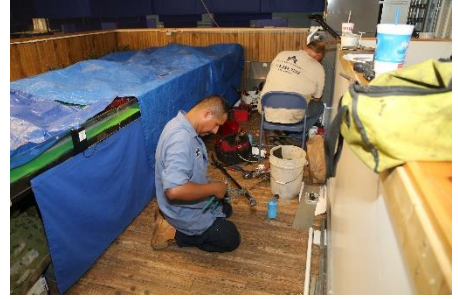
Gas line assembled