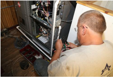
Water condensation pump routed