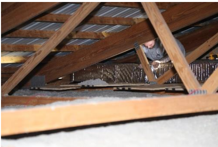
Attic ducts insulated and taped