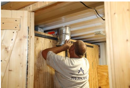
Duct routed to store and Backshop