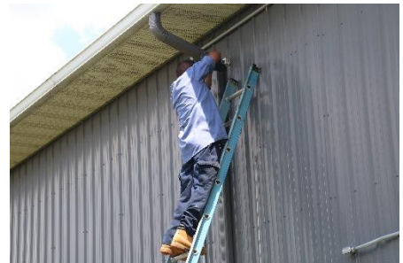
Outside heating exhaust