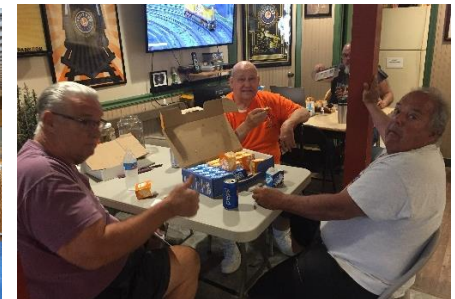
CLRC Crew observing installation