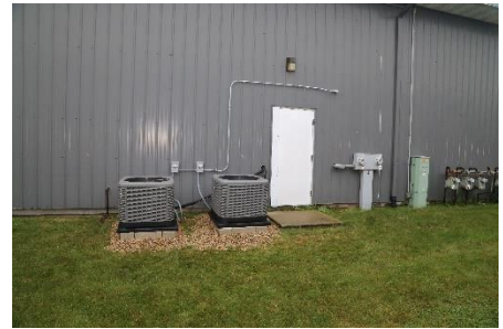
Two big compressors