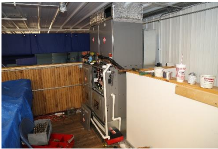
Two big units on mezzanine level