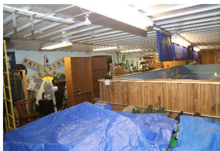
Mezzanine layout is tucked in