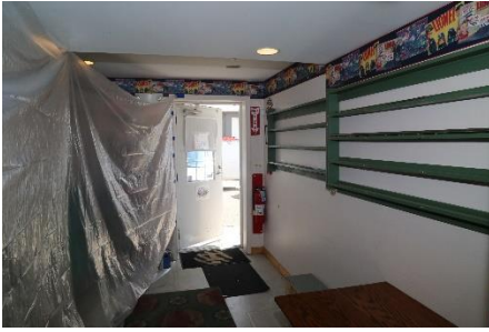
Plastic sheet is put up to protect the CLRC Store and Layout