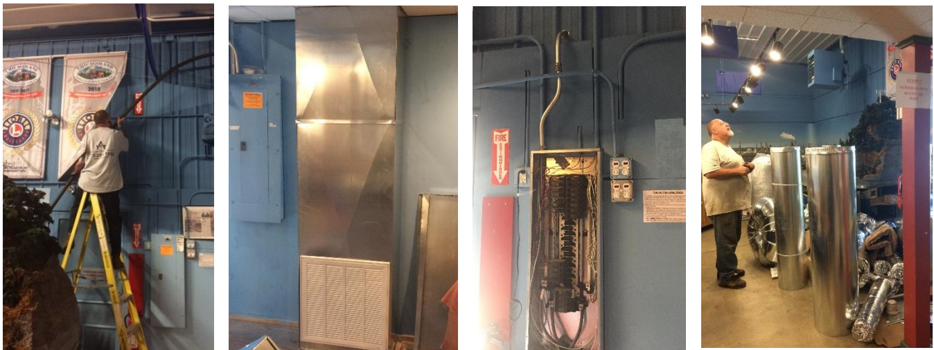
Able HVAC installs our heating and air conditioning system

We are growing into our building even more as we now have a new HVAC unit with duct work that travels throughout the building. The Duct Work was routed through the attic, so no trunk duct work is observed. (I did not even know that we had ample space in the attic.) Two big outlets are in the center of the main hall and duct work extends to the CLRC Store and Back Shop. Two big heater/AC units were installed. Both units run for the AC and one heater runs with the second unit joins in when needed. By the way we were told not to change the AC setting as the units work better when maintaining the temperature rather than the big swings that turning it off will bring. It was tested Wednesday, July 31, 2019 and was it sweet. The AC thermostat is set to 74°. The next time you come, you will enjoy the comfort.