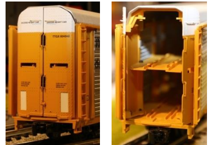
End Doors closed and open

I like how the side screens show just a little of the inside of the car. The end doors have nice detail with the grab irons to open the doors. The open doors show the two level decks for pickup trucks and larger SUV's. The bottom has molded in brake structures. The "kinematic" couplers have a nice mechanical design.