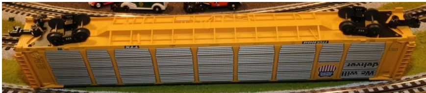
Molded in Brake assembly

Know that the car has height restrictions. Most of the older Lionel bridges are well under 5".