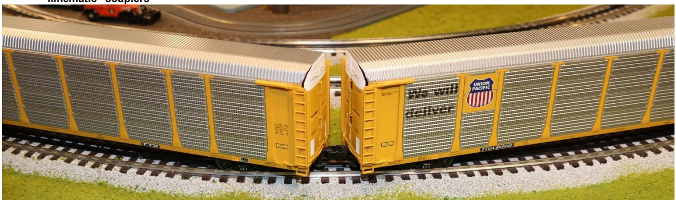
"kinematic" couplers keep cars close on curves

If your railroad is ready for some BIG cars, this one comes highly recommended.