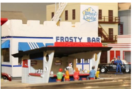
White Castle and Frosty Bar