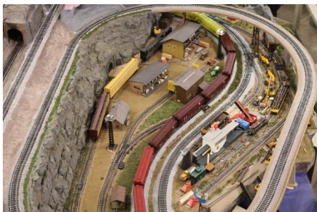
Birdseye view of the Lumber Co.