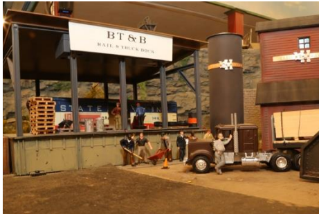
BT&B Rail – Truck Dock