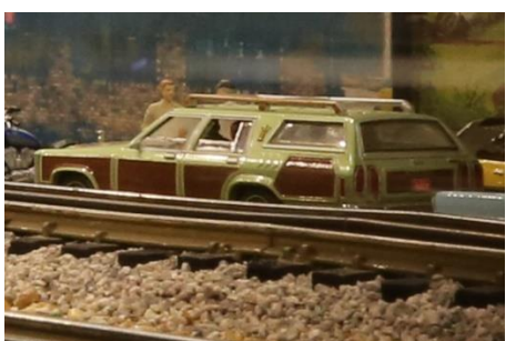
Christmas Vacation Station Wagon