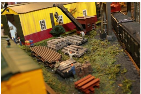
Maintenance of Way RR Tie Yard