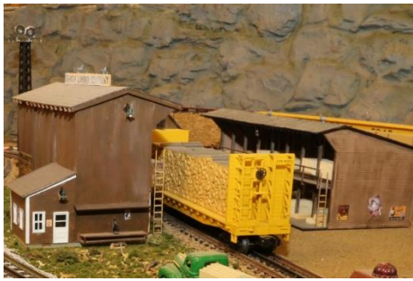
Lehigh Lumber Co.