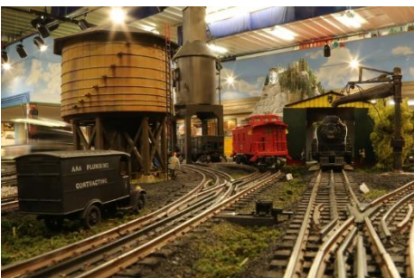
Steam Watering and Coaling Station