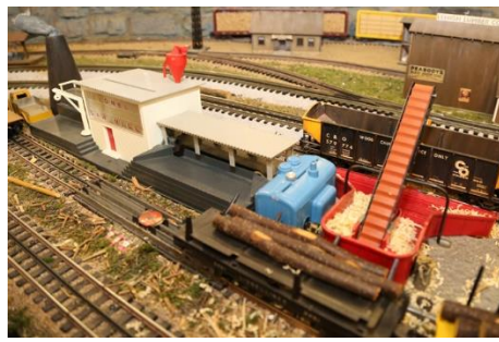
Sawmill and Saw Dust Conveyor