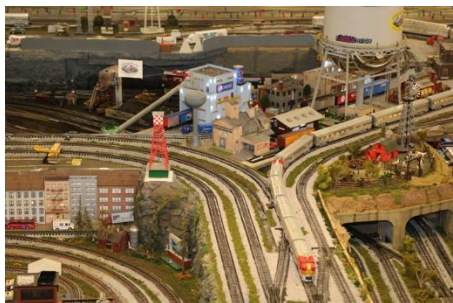
Santa Fe running the CLRC Ridge