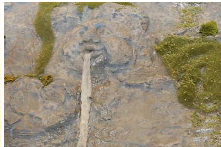
Happy Face Falls