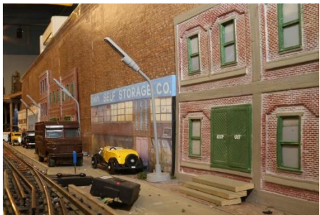
Main Street in the Valley