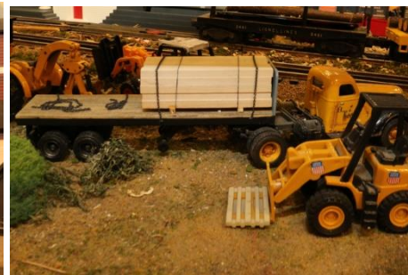
BT&B Lumber Truck