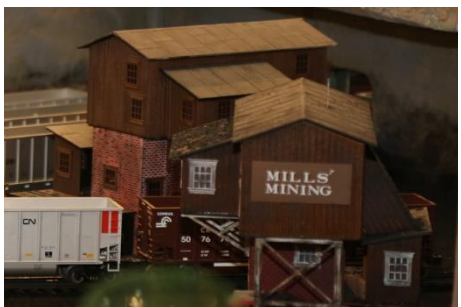
Mill's Mining Head Quarters