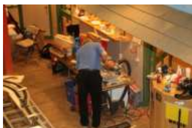
Swav is cutting the next piece