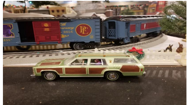
The Griswold's left for home after spending their Christmas Vacation as the CLRC Clubhouse.