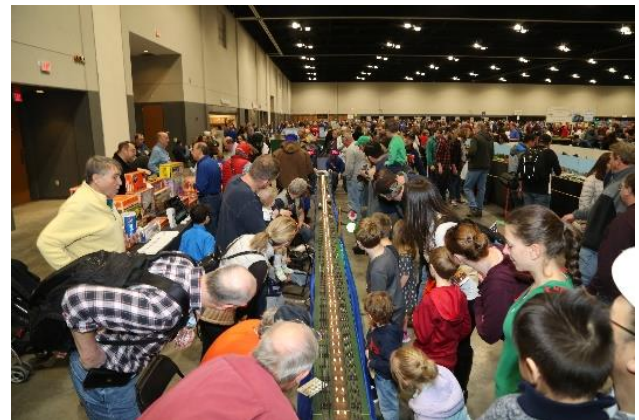
Big Crowds enjoyed the Drag Strip

We started out with a bang, running our Drag Strip at the World's Greatest Hobby event to see who had the fastest engine. We were very surprised with the crowd we drew, passing out our trifold pamphlet showing the highlights of our club and dates of our Open Houses. It was nice to see Lionel come to see our event and continue to support our club.