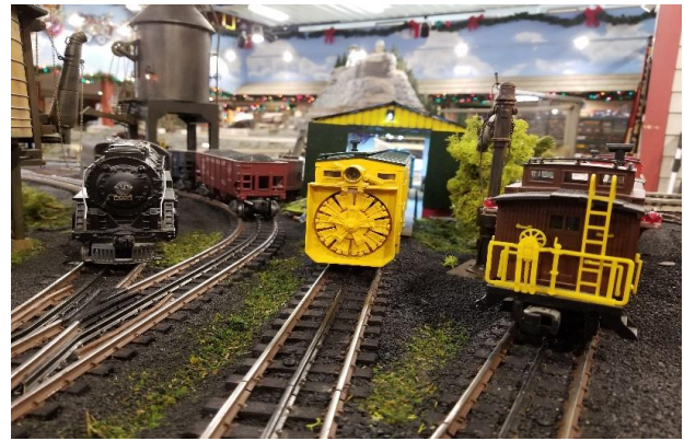
The Chicago and Northwestern snowplow was taking a rest after clearing the tracks.

The January Open House was well staffed by our members. It was rewarding to our guests who enjoyed the full support of our members showing them the details of the layout and our club. Many of our guests were new saying they saw us in Facebook.