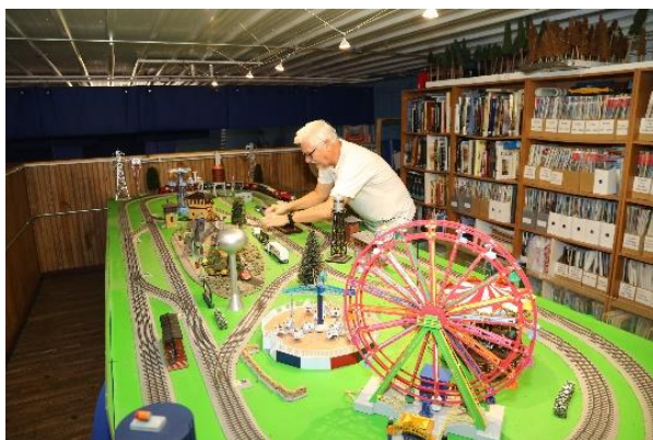
Joe works on the Sodor Island layout