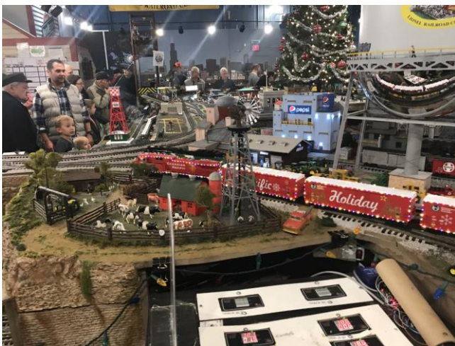
The clubhouse decorated for the holidays

Thank you to the members who braved the foul weather to ensure our visitors had a great time. Without your efforts, events like these are not possible.