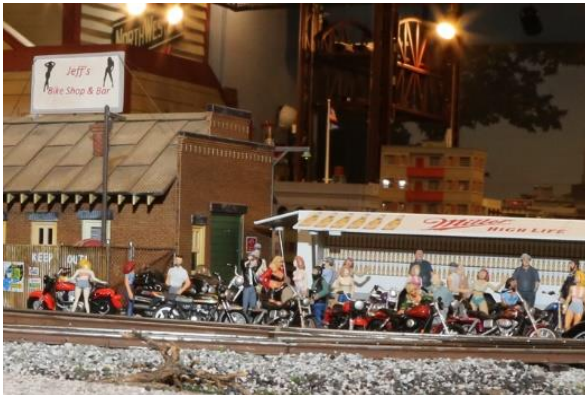
Jeff's Bike shop and Bar